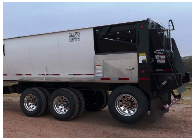
TANDEM WITH AIR LIFT TAG(OR PUSHER)