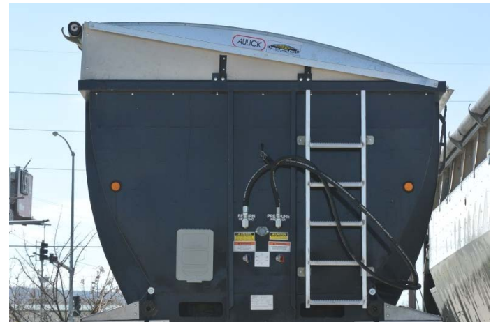
TAPERED EXTENSIONS (OPTIONAL)