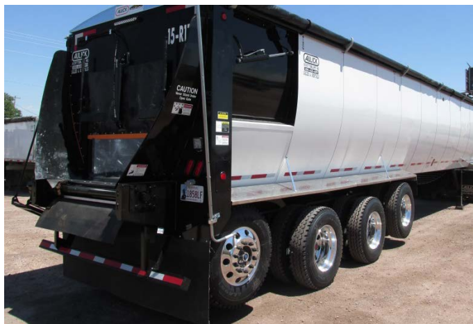
QUAD AXLE STEERABLE LIFT