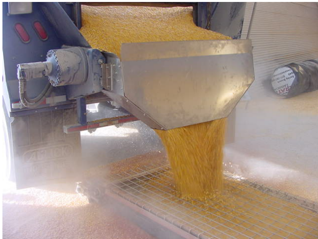
GRAIN CHUTE (OPTIONAL)