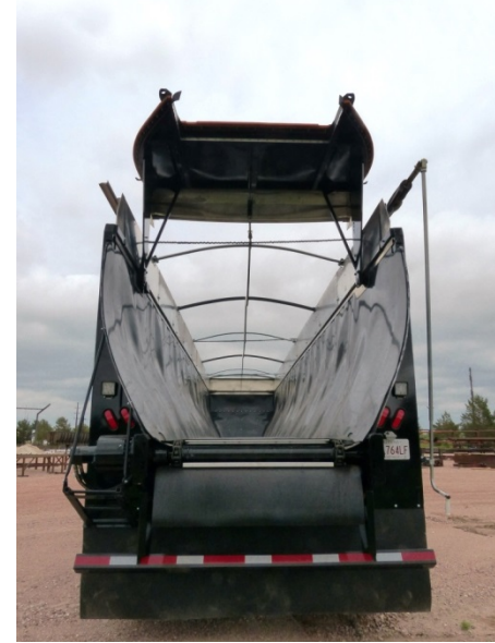
FULL OPEN – UNRESTRICTED END GATE ( STANDARD)