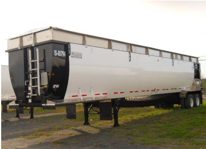
SOLID SIDE EXTENSIONS (OPTIONAL)