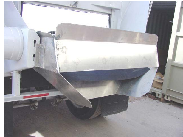
GRAIN CHUTE (OPTIONAL)