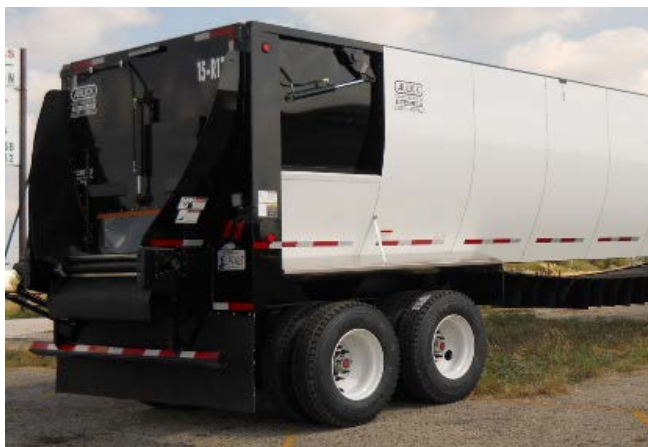
TANDEM SET FORWARD 18 INCHES