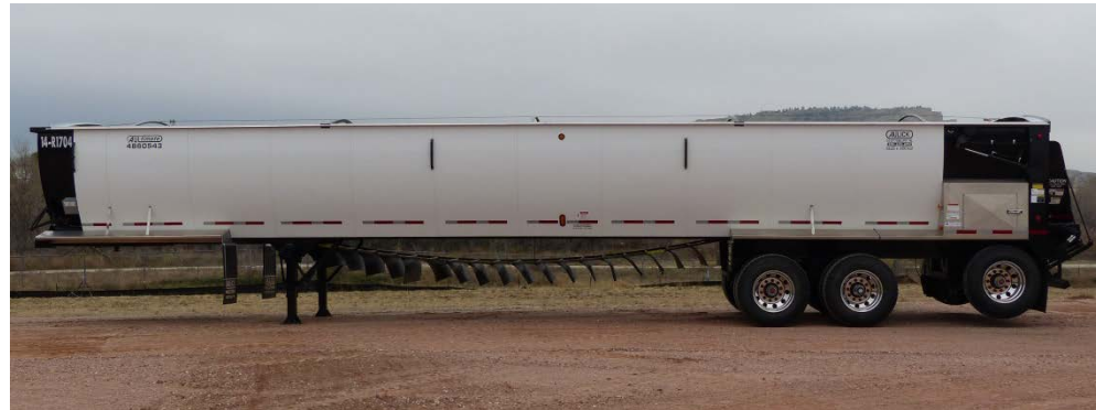
ALUMINUM SHEETING (OPTIONAL)